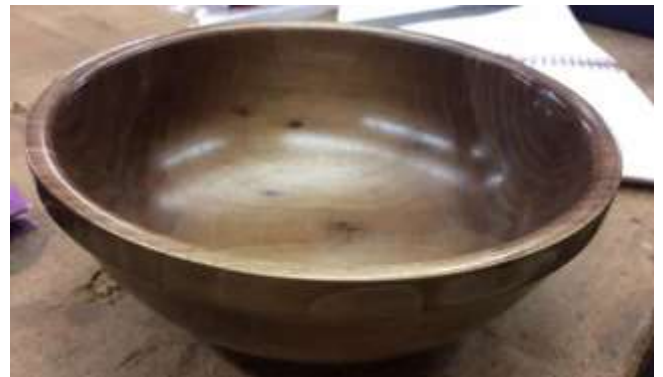
Bob Francis showed a 7 1/4" X 4 1/2" Oak burl bowl, a collection of rings and bangles made of Maple, Walnut, Ipe, and Mahogany, and a 9" X 3 1/2" Walnut bowl