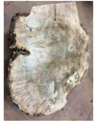
Phil Arcouette – Maple burl

Many suggestions were offered for each burl, with at least 5 suggestions for each one.